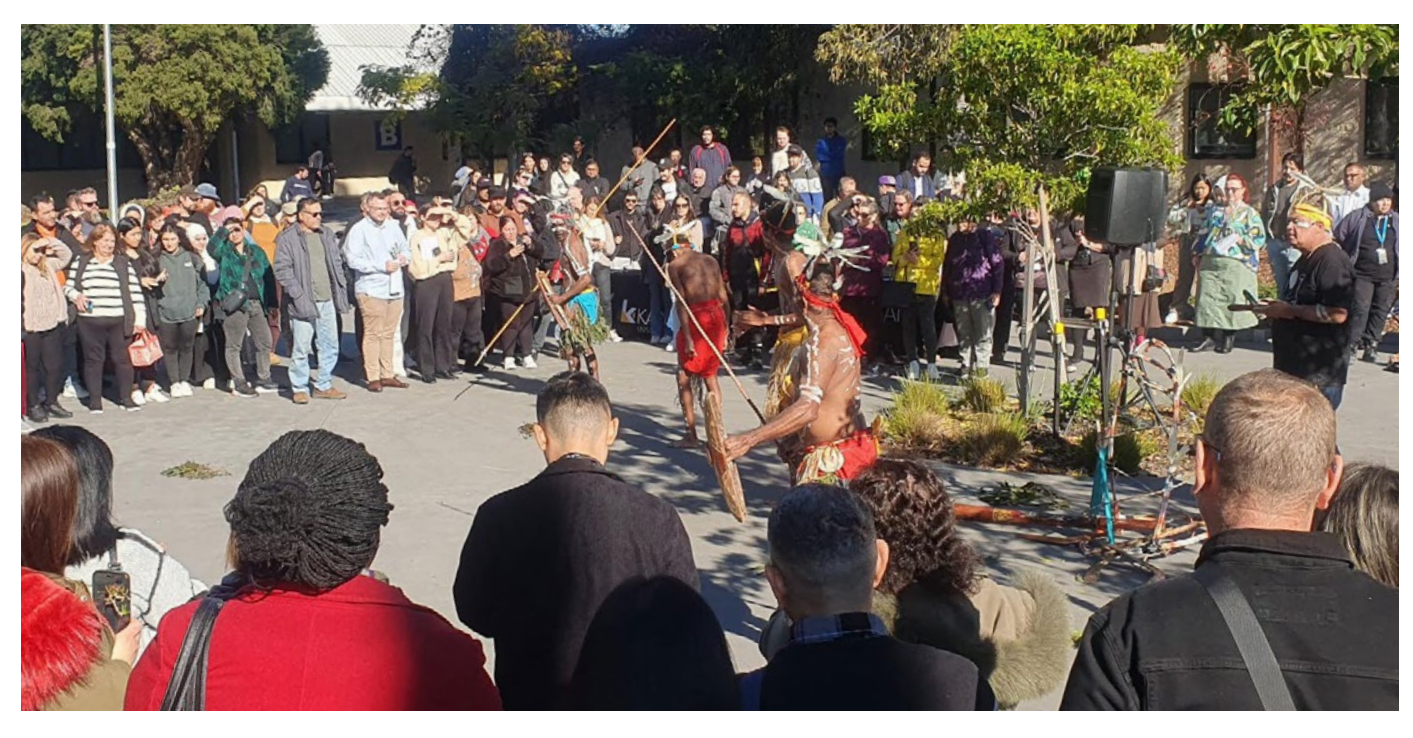
National Reconciliation Week event at Broadmeadows campus (Wurundjeri)